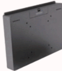
Android Box Module

Intel® N97 (6M Cache, up to 3.60 GHz) Intel® Core™ i3-1215U(10M Cache, up to 4.40 GHz) Intel® Core™ i5-1235U(12M Cache, up to 4.40 GHz)