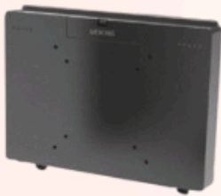
Windows Box Module

Intel® N97 (6M Cache, up to 3.60 GHz) Intel® Core™ i3-1215U(10M Cache, up to 4.40 GHz) Intel® Core™ i5-1235U(12M Cache, up to 4.40 GHz)