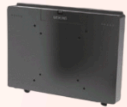
Touch Monitor Box Module

RK3568 4 x Cortex-A55 up to 2.0GHz RK3588 4 x Cortex-A76 + 4 x Cortex-A55 up to 2.2GHz RK3576 4 x Cortex-A72 + 4 x Cortex-A53 up to 2.2GHz