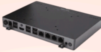
System Box Module